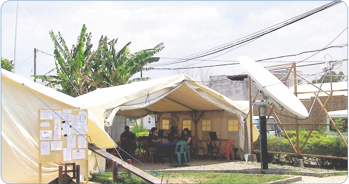
This is the UN facility in Banda Aceh, Sumatra. It was established by Drastic in partnership with an organization called Pactec International.